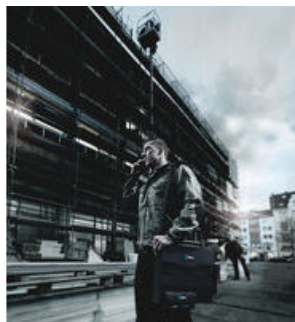
Wera 2go Tool Container with inner and outer hook and loop fastener system Individually configurable for greater mobility Ideal also for the docking of Wera textile boxes and pouches equipped with hook and loop fastener zones Easy insertion and removal Hands remain free during transport