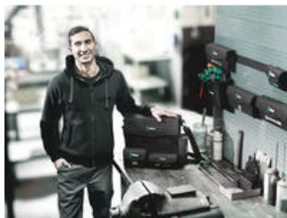
Wera 2go 2 - The outside and inside packer