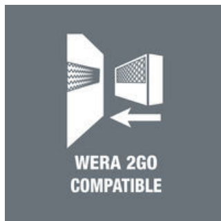
Wera packaging bearing this symbol contains tool pouches or textile boxes with nonwoven sections that can be docked with the Wera 2go system.