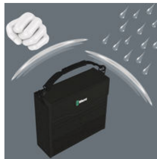
The robust and dimensionally stable material protects the tools carried against damage and moisture and enhances the service life of the tool container.