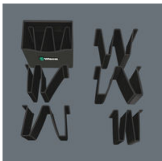
The variably adjustable hook and loop fastener partition in the Tool Quiver ensures neat and tidy arrangement of the tools.